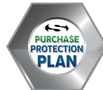
PPP - Purchase Protection Plan