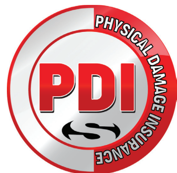
PDI – Physical Damage Insurance